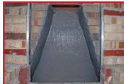
Smoke chamber walls after being parged smooth with Cerfractory Foam.