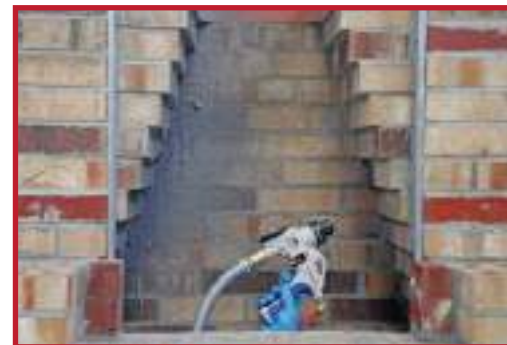
Cerfractory Foam application seals gaps, cracks, holes and streamlines smoke chamber walls