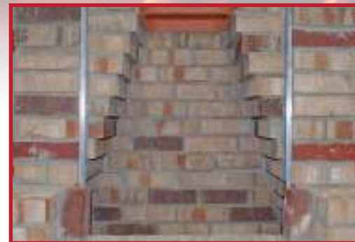
Exposed smoke chamber walls before Cerfractory Foam application